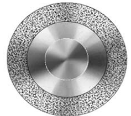
Single Sided Diamond Disc